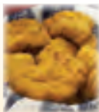
Chicken Dippers (2 Side Sauces) SAUCES: RANCH, HOT SAUCE, BBQ, OR BLEU CHEESE