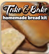
Take & Bake homemade bread kit

100% Royalties from Fair's Best products Go to Help Homeless Women & Children!