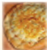
Cheese Bread (10" round) (2 Side Sauces) ADD BACON OR BANANA PEPPERS (EXTRA)