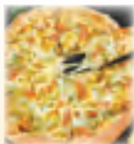
Tuscan Bread (10" round) (2 Side Sauces) Garlic Pesto sauce, tomatoes, cheddar, & Mozzarella.