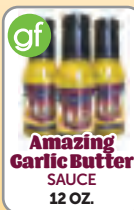
Amazing Garlic Butter SAUCE 12 OZ.