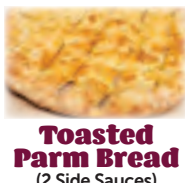
Toasted Parm Bread (2 Side Sauces)